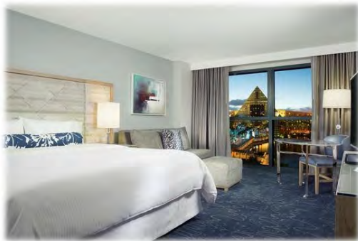
New room design for the Swan (758 guest rooms)